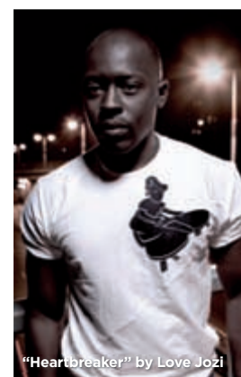
"Heartbreaker" by Love Jozi

– sophisticated production techniques have allowed us to print a relatively small amount of shirts and still make a profit.