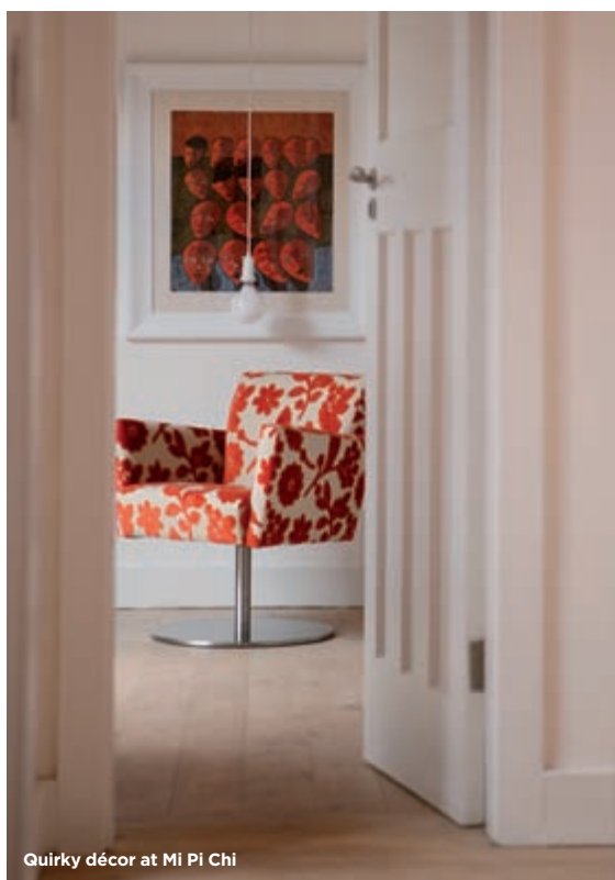
Quirky décor at Mi Pi Chi

It's a little bit African – vibrant linocuts by Mozambican artists – and